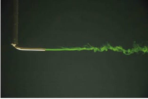
Figure 1. Short captions are centered.